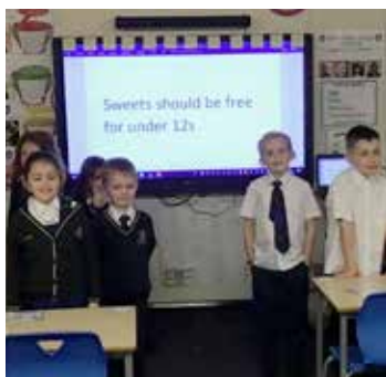
Trust Parliament members at Hart Primary School with one of the motions they are discussing