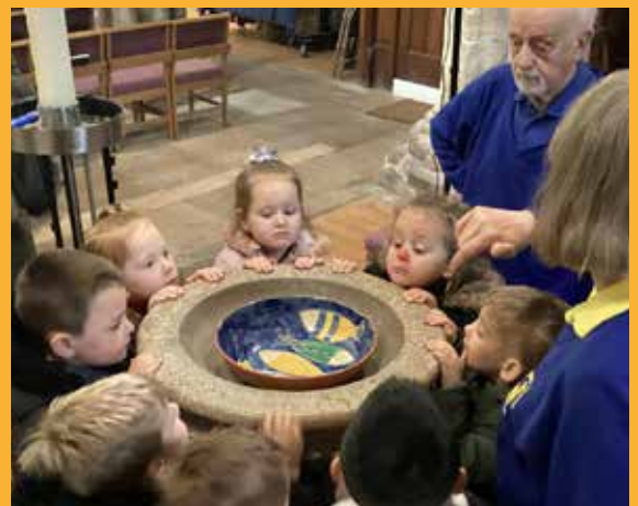
Reception class at St Helen's Primary School enjoyed visiting St. Hilda's church to find out about the church and learn more about Holy Week.