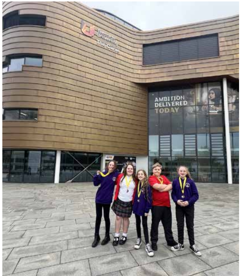
About to face the dragons: St Helen's pupils at Teesside University

"The dragons loved it and generously agreed to fund the whole project."