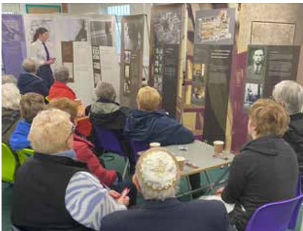
The presentation to the local community at Venerable Bede

Venerable Bede CE Academy pupils were presented with special certificates and now have the opportunity to become ambassadors of the Anne Frank Trust, taking part in events and visiting key historical sites such as Auschwitz and Anne Frank's house.