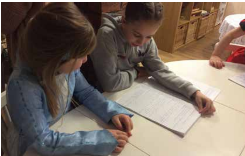
Year 5 at Holley Park Academy are pictured reading their own stories that they had written with buddies to celebrate World Book Day.