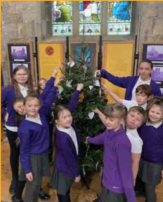
Pupils from the Grange Primary choir attended the annual Christmas Tree Festival at St Hilda's church. Pupils made decorations for the Christmas tree linked to the theme of peace.