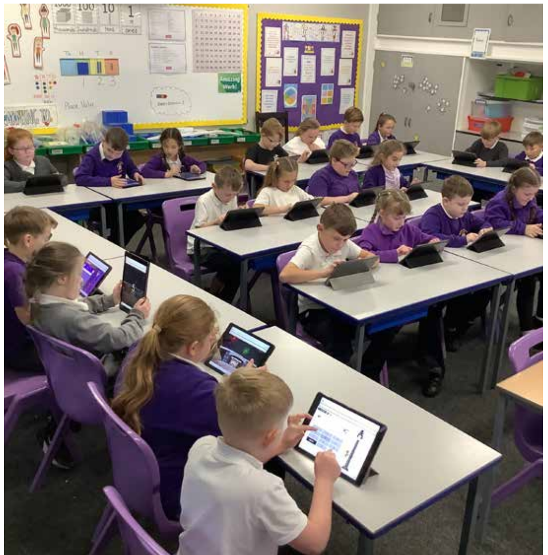
A study of concentration... pupils at Grange Primary School taking part in the tournament

We can't wait to celebrate with these children and highlight other individuals for their effort and improvement!