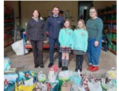
At the foodbank with sacks of donations

The activities won the Bright Sparks challenge for raising an incredible amount of money for Alice House Hospice and supporting the vulnerable in their community, by hosting a befriending service in partnership with Cleveland Fire Brigade.