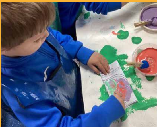
Easter excitement started in Nursery at Dame Dorothy Primary School with lots of paint, egg counting and fun together.