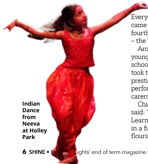
Indian Dance from Neeva at Holley Park

Everyone across Northern Lights came together for the Trust's fourth annual One Voice concert - the biggest and best yet!