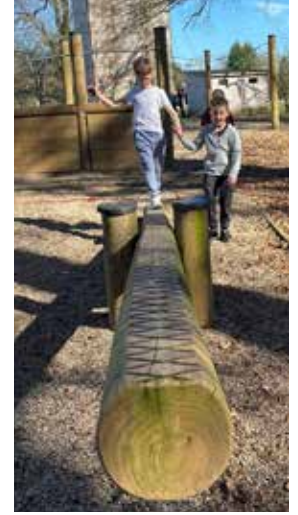
Year 3/4 children from Firthmoor were at Newby Wiske at Northallerton for an action-packed day of activities and a sleepover.