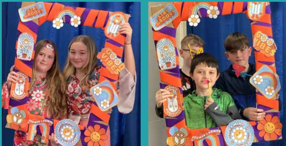
Children in Year 5 and 6 at Tilery Primary School enjoyed celebrating all things 1960s.