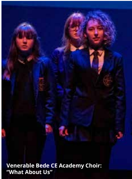
Venerable Bede CE Academy Choir: "What About Us"