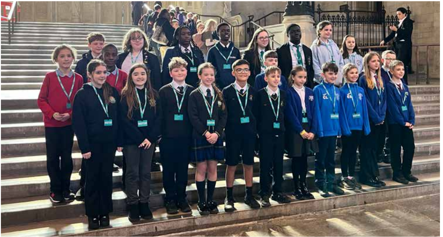
The Northern Lights Trust Parliament line up at the Palace of Westminster for a team picture