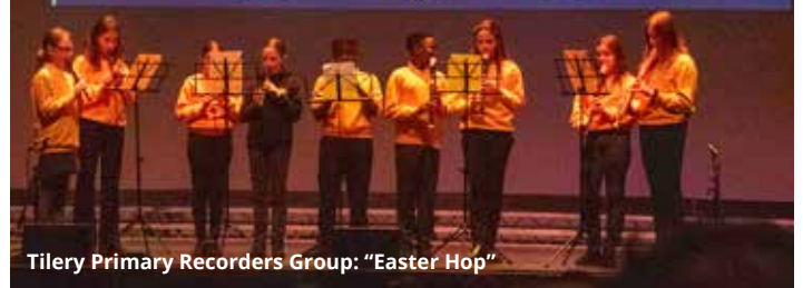
Tilery Primary Recorders Group: "Easter Hop"

some amazing performances and children growing in confidence. It was a memory our children won't ever forget and served