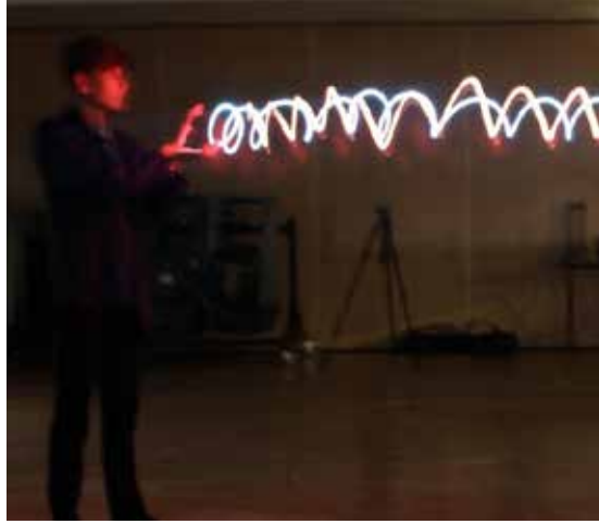
Year 10 photography students at St Aidan's CE Academy have completed a light painting workshop. They produced some fantastic work and really enjoyed the process.