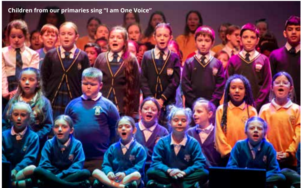
Children from our primaries sing "I am One Voice"