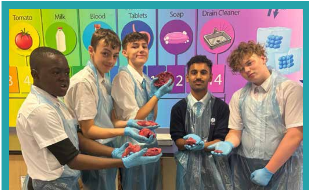
Year 11 students from St Aidan's CE Academy became mini-scientists when they took part in a heart dissection experiment.

groups, they demonstrated exceptional teamwork to create their own handcrafted clay pots, thoughtfully shaped and carefully decorated in the style of classical Greek ceramics."